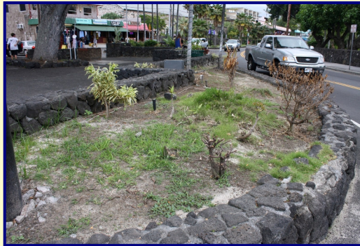
Post-Tsunami Landscape Damage

Landscaping in Emma's Square in Historic Kailua Village was significantly damaged by the tsunami that resulted from the March 11 earthquake off the coast of Japan. Kailua Village Business Improvement District provided funding so that KVBD's landscape crew could complete the work needed to restore the Square to conditions that look even better than pre-tsunami.